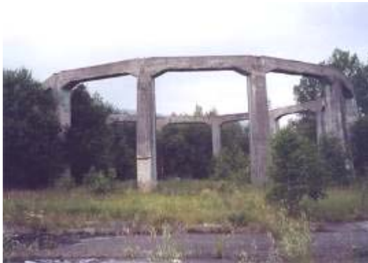
Test Rig: Distance shot of the Bell test-rig in 2004 by an anonymous source.