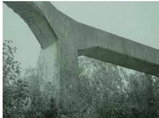
Sturdy Construction: Weight capacity estimated at capacity of at least 100 tons.

Not only did I publish "Einstein's Antigravity", but I made sure that it stayed on the main page of American Antigravity for maximum exposure & impact. The idea was to begin educating the public about this remarkable technology, and I was sure that the way to approach it was to saturate the web with links & online references.