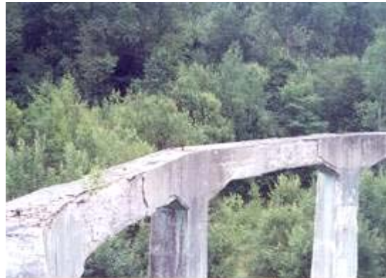
Rappel Shot: Anonymous source saw rungs for securing a propulsion device for the Bell.

There were a couple of residual problems to this story that bothered me: the first being the after-story. This Nazi-Bell project begins and ends in World War II, with no mention of where Kammler finally ended up. My guess is that it was either the USA or Russia, depending on who offered him the most money and asylum.