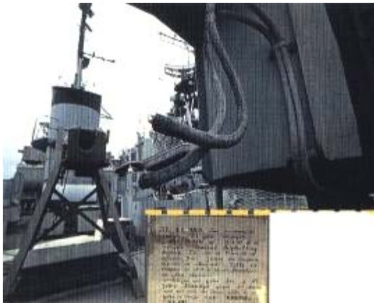
The Eldridge: Power-cables from the Phil. experiment are still visible 50 years later.