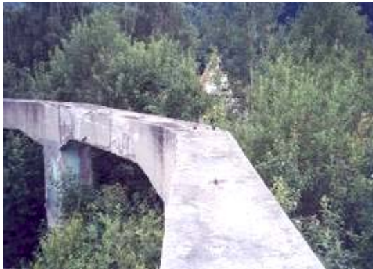
Test-Rig Top: Another shot of the top of the Bell rig from the anonymous source.