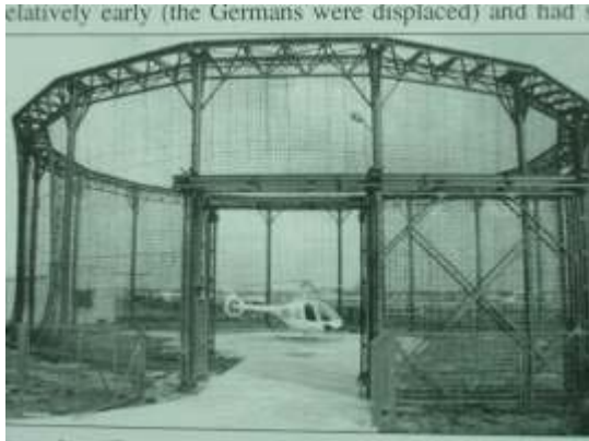
The Flytrap: A modern-day equivalent of the Bell test-site, used for helicopter testing.

Dering didn't elaborate much on the Rhine Valley experiments, except to say that they also incorporate something called "Zenic" or "Zinsser" surface-waves (can't remember which). These are apparently a very efficient method of transmitting electricity through