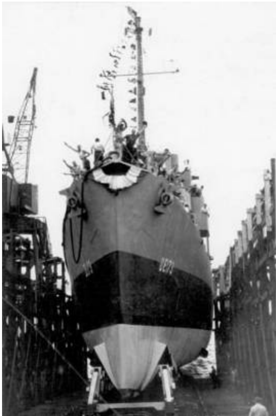
DE 173 Eldridge: A photo of the Eldridge in dry-dock during construction.